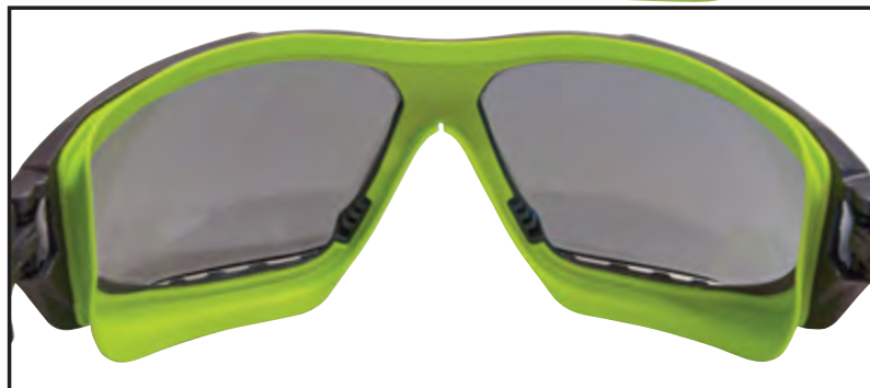
Soft TPR gasket provides full protection