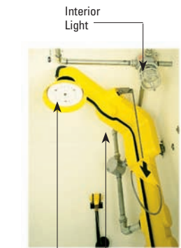
20 GPM Regulated Shower Head Freeze-Protected Shower option shown

Create your model to meet the specific needs of your facility.