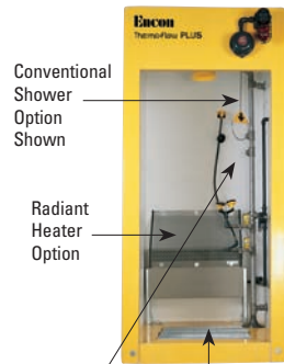
Conventional Shower Option Shown Radiant Heater Option ANSI Certified Grated Floor