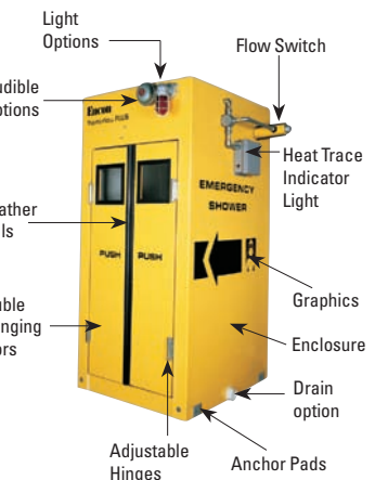
Light Options Audible Options Weather Seals Double Swinging Doors Adjustable Hinges Flow Switch Heat Trace Indicator Light Graphics Enclosure Drain option Anchor Pads