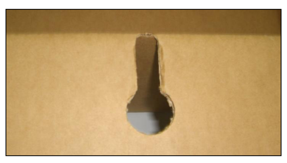
Figure 2: Perforation cut out.

2. On one of the box flaps you will see a perforated cut. Press firmly on the perforated area to remove the cardboard.