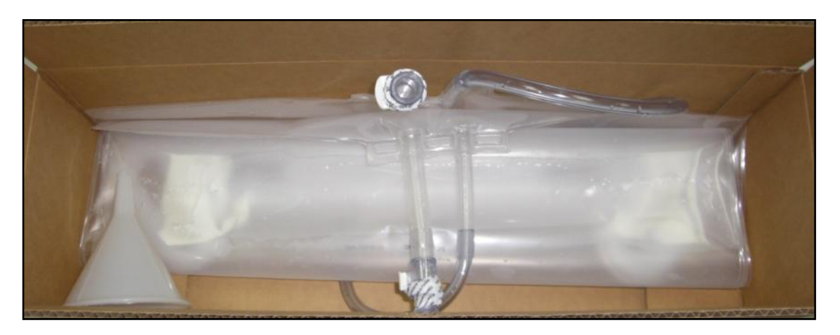
Figure 1: Fill Kit packed in Box.

1. Open the AQ111 box. Inside you will find two expiration date labels, a funnel, and two eye wash cartridges with a few ounces of Hydrosep<sup>®</sup> in each bag.