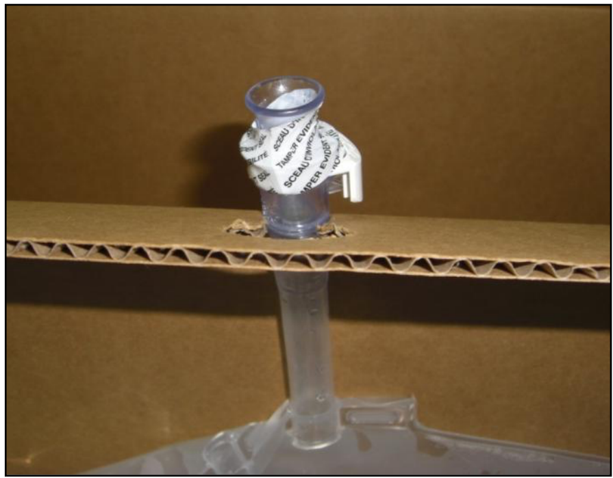
Figure 3: Aquarion<sup>®</sup> valve slid into slot.

4. Removed the tamper evidence seal, compress the white push button and then remove the plug/cap.