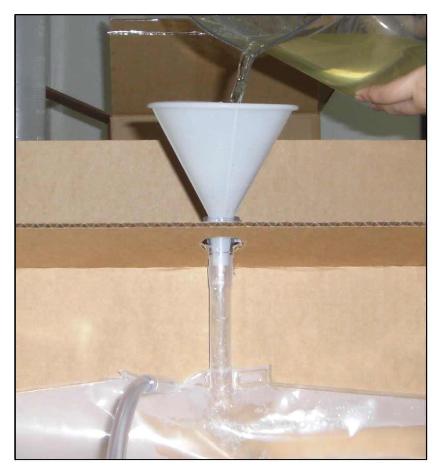
Figure 5: Funnel installed for filling.