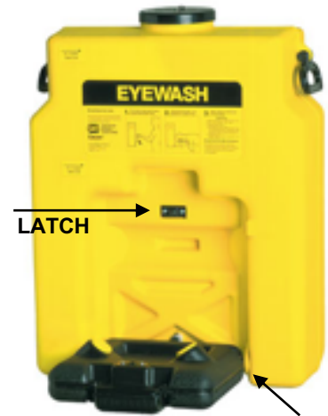
PIVOT PIN LOCATION