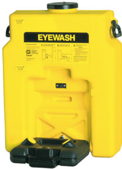
FIGURE 1 MODEL 01104050 SHOWN (See installation instructions on page 4)

Portable 14 Gallon Self-Contained Gravity Fed Eyewash units for use in areas where plumbed potable water is not available. Units are designed for wall mounting or mounting on a transport cart, as well as a stand-alone on a shelf.