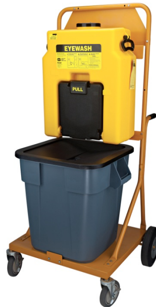
FIGURE 2 MODEL 01104055 SHOWN (See installation instructions on page)