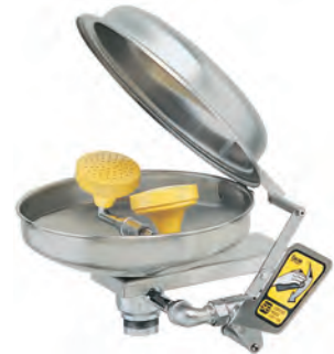
MODEL 01045501SBC Wall-mounted Facewash