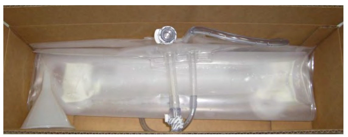
Figure 1: Fill Kit packed in Box.

1. Open the AQ111 box. Inside you will find two expiration date labels, a funnel, and two eye wash Cartridges with a few ounces of Hydrosep in each bag.