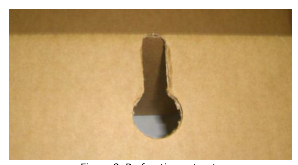
Figure 2: Perforation cut out.

2. On one of the box flaps you will see a perforated cut, press firmly on this perforated area to remove the cardboard.