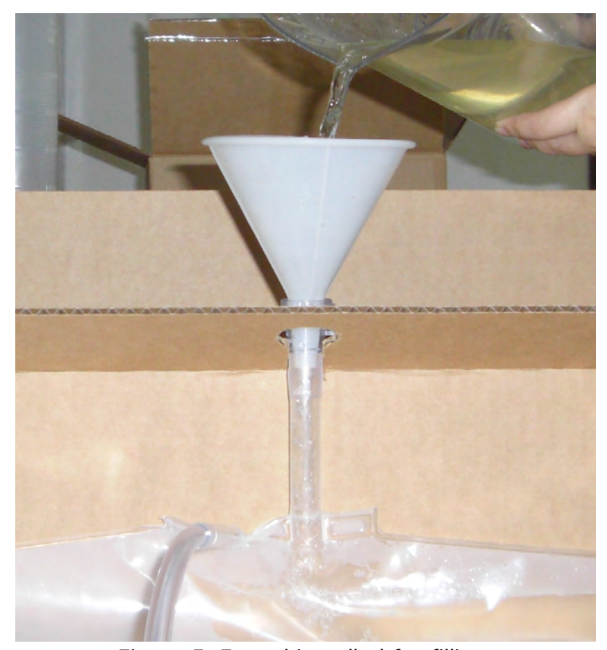
Figure 5: Funnel installed for filling.

Note: Filling the cartridge with the correct amount of water is critical to the system meeting the ANSI Z358.1 Standard.