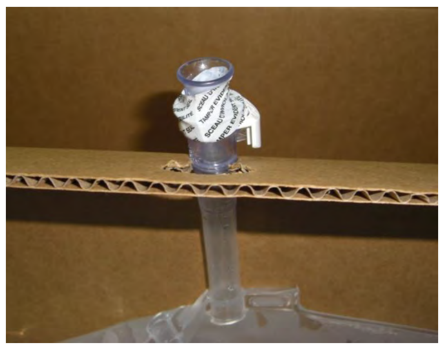
Figure 3: Aquarian Valve slid into slot.

3. With the bag laid out on a flat, stable surface, insert the valve of the Aquarion bag through the hole and slide it back into the thinner slot to keep the bag in place.