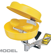
MODEL 01035511PBC Wall-mounted Eye/Facewash with Strainer