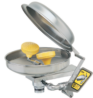
MODEL 01045501SBC Wall-mounted Facewash