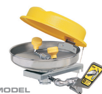
MODEL 01045001PBC Wall-mounted Eyewash