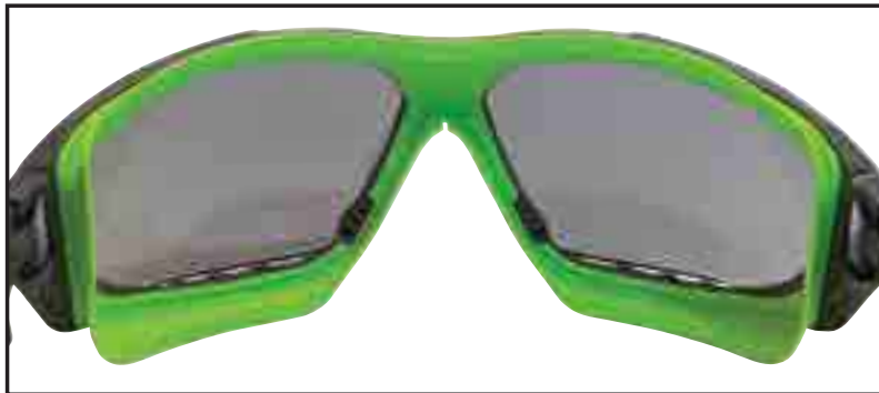
Soft TPR gasket provides full protection